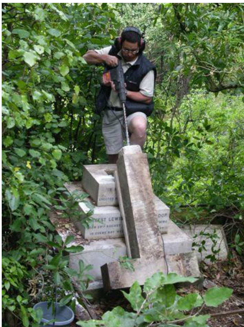
Repair of the Widdop memorial (grid F10-1) on Trustees Crescent path.