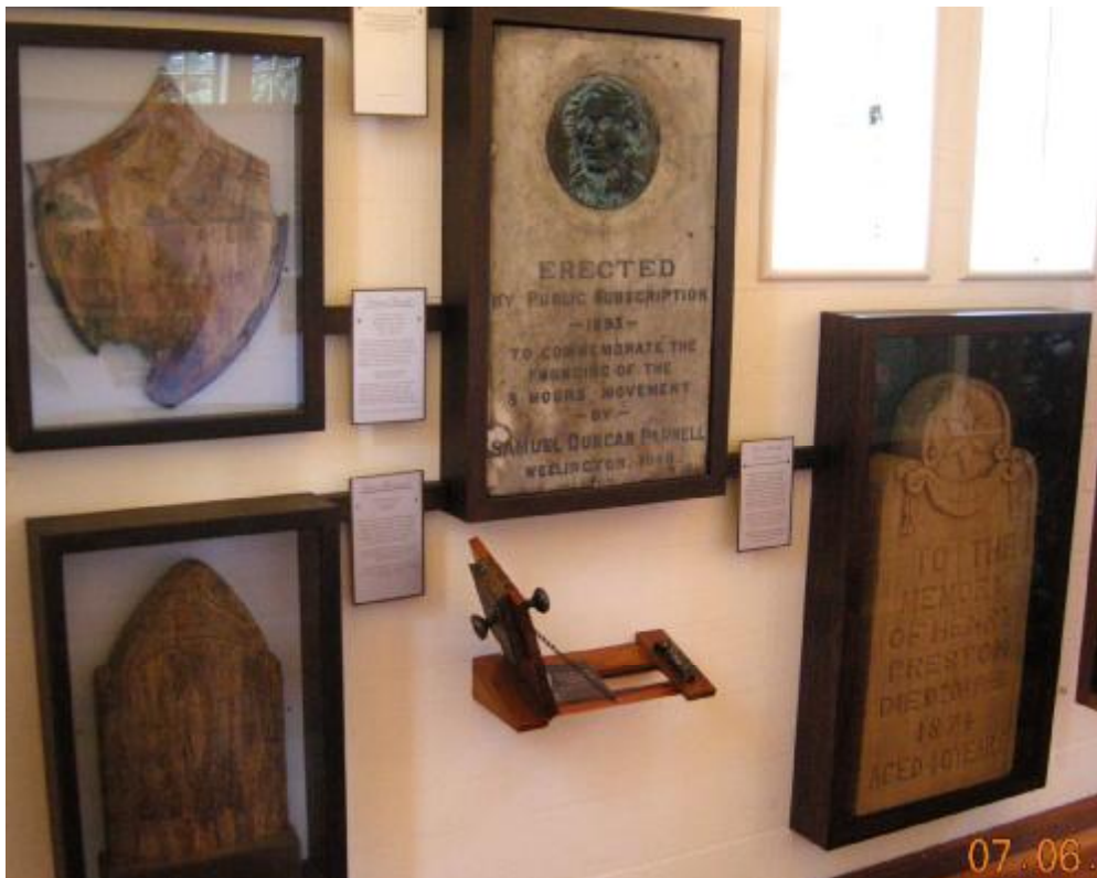
Preston headboard (lower right)