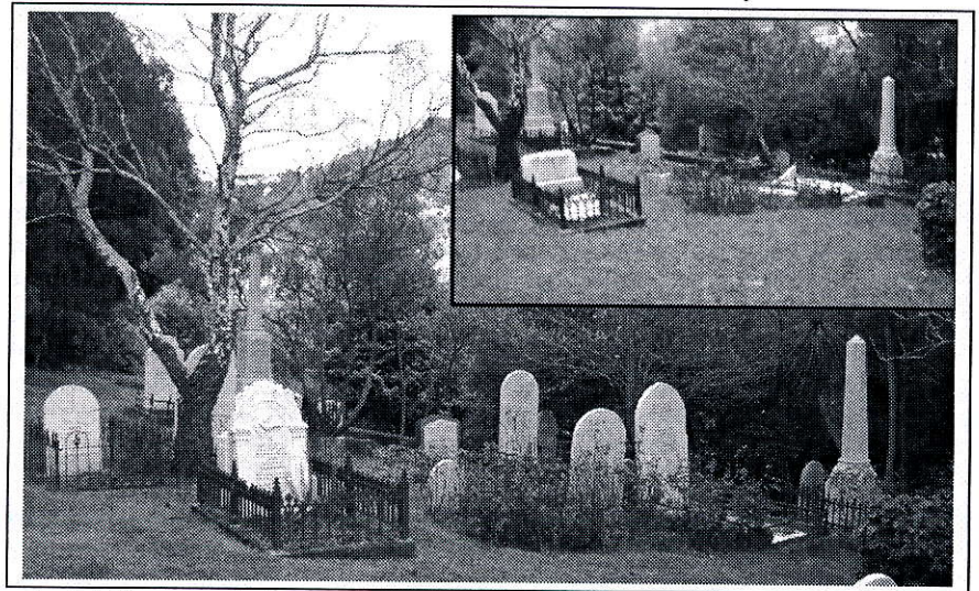
Jewish Cemetery before and after (inset) the vandalism

The smashed headstones are made of white marble, except for one of sandstone. They have leaded inscriptions in English, Hebrew or both languages, and range in date from 1878 to 1904. They are within the small area of land which was allocated in the middle of the 19 th Century for a Jewish cemetery.